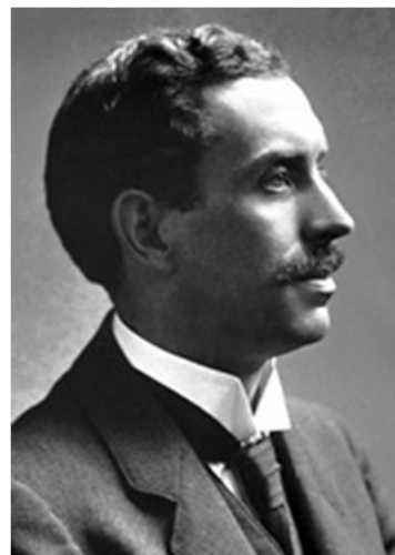
Professor Charles Glover Barkla University of Liverpool Alumnus Nobel Prize in Physics 1917

The lecture is aimed at a broad audience and undergraduates are invited