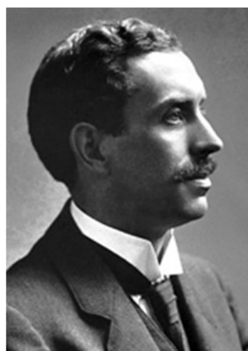
Professor Charles Glover Barkla University of Liverpool Alumnus Nobel Prize in Physics 1917

The lecture is aimed at a broad audience and undergraduates are invited.