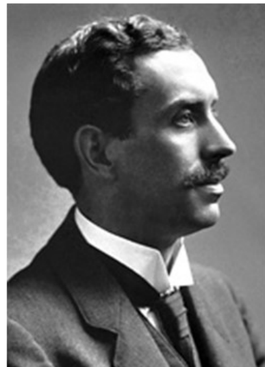
Professor Charles Glover Barkla University of Liverpool Alumnus Nobel Prize in Physics 1917

The lecture is aimed at a broad audience and undergraduates are invited